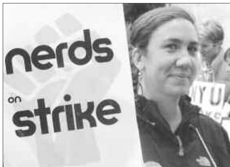
Geek chic was on display at NYU when graduate workers set up picket lines after they began a strike November 9. See article, page 6.