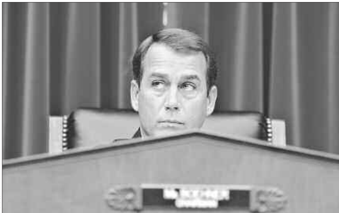
Rep. John Boehner, chair of the House education committee, in a hearing on the Higher Education Act

lion in new charges would boost the cost of a typical student’s college loans by $5,800. Some important aid measures, such as new funds for Perkins Loans for low-income students, would be eliminated.