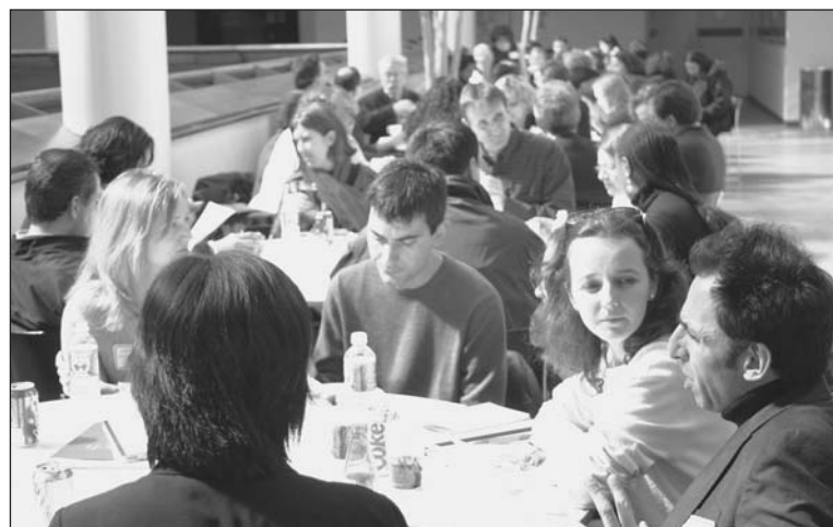
Junior faculty got a chance to meet each other over lunch during the event.