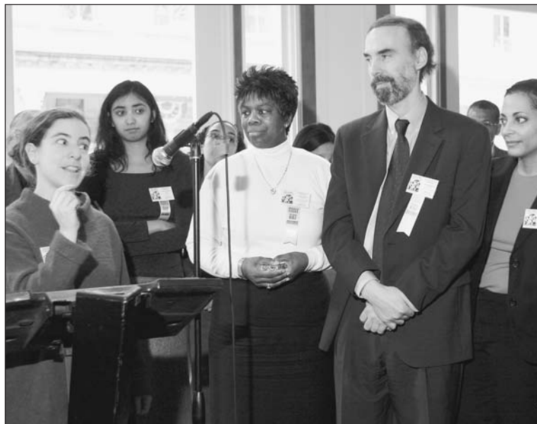
Activists with the Coalition for Access to Training and Education (CATE) were honored at CUNY Day for winning expanded college access for welfare recipients.

"Some students shepherded their friends over to sign after they had signed themselves," he said.