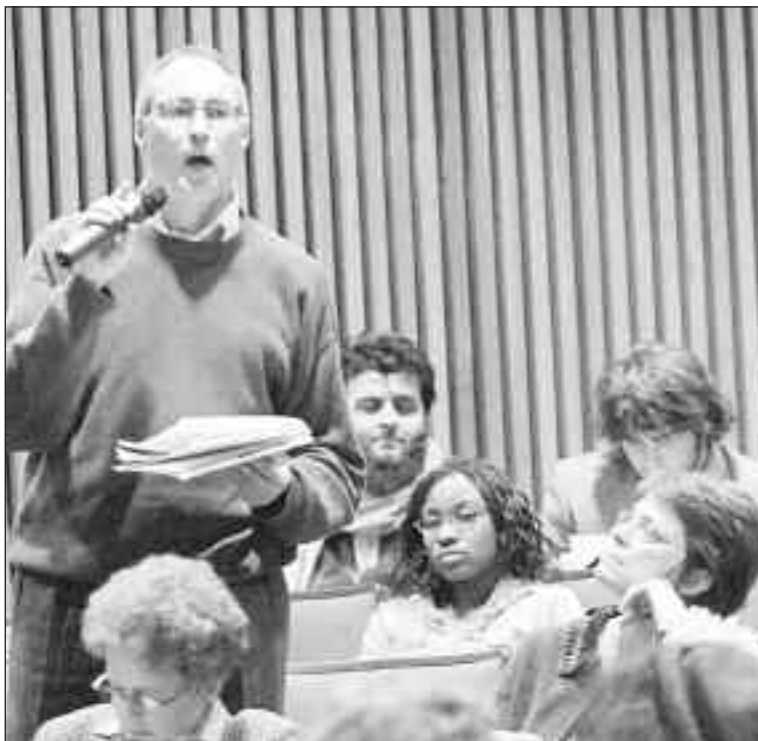
Members spoke about academic freedom at a December 2005 meeting of the Hunter College Senate.

ulty that if they don't buy into the administration's decisions, then their department can be at risk."