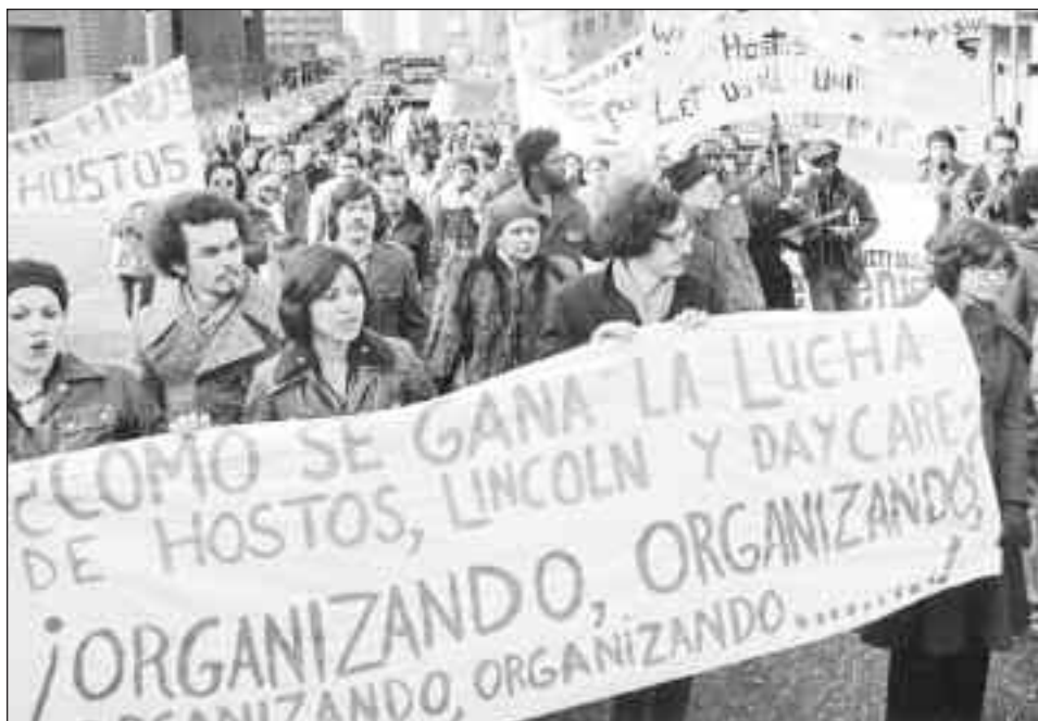
The PSC, students and community joined together and saved Hostos.

In November 1975, the college Senate established a Save Hostos Committee (SHC), with subcommittees on Letter-Writing, Petitioning, Voter Registration, Community Outreach, Finances, and Publicity. The SHC, which I chaired, organized a number of large demonstrations, including a March 11 rally at City Hall that attracted hundreds of supporters. Twenty thousand names were ultimately collected on petitions, countless letters were sent to elected officials, and fact-sheets touting the achievements of the college were widely distributed.